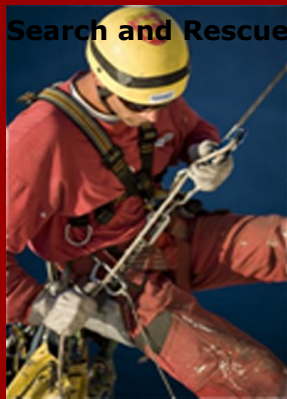
Search and Rescue